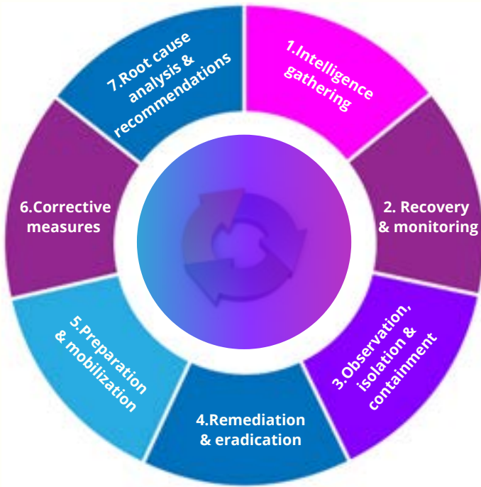
Incident Response lifecycle